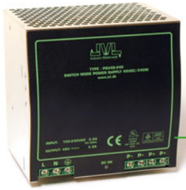
PSU48-240 Power Supply